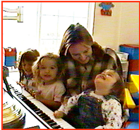
Playing the Piano